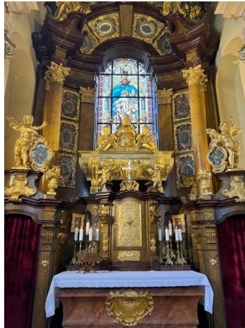
Saint Norbert of Xanten above the altar in a chapel within the Abbey of Strahov.