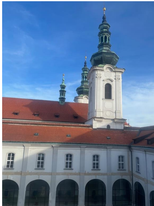
View from the guest accommodation in the Abbey of Strahov looking over the cloister to the abbey church and bell towers, which contain five beautiful new bells that were installed as part of the 900 th year anniversary.

I met many of the community in Prague and another novice from the Abbey of Tepla (also Czechia), who is studying at Strahov. I am due to return there in August or thereabouts and will at some point over the next year have to stay there for a month. Not enough time to learn Czech but I will brush up on the little Latin I know because they use it for the Liturgy of the Hours. I had to be cautious on my recent visit because the prayers and Masses are all streamed and recorded. I had a microphone straight in front of where I was sat! We may have a member of the community come over for a period of time later in the year and we await the decision to be made on a member from our close relations, the Dominicans. He has written a book about the Norbertine Order returning to the UK, which I believe has been published whilst I was away. I do not know where it is available yet, so I will let you know when I write during Eastertide.